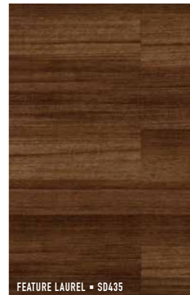
FEATURE LAUREL ▪ SD435