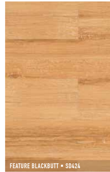
FEATURE BLACKBUTT ▪ SD424