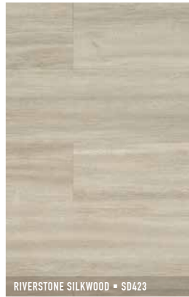
RIVERSTONE SILKWOOD ▪ SD423