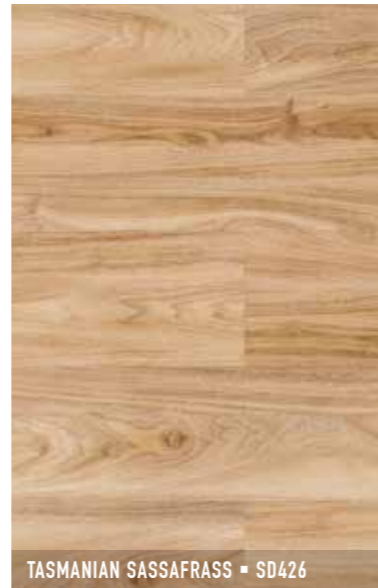
TASMANIAN SASSAFRASS ▪ SD426