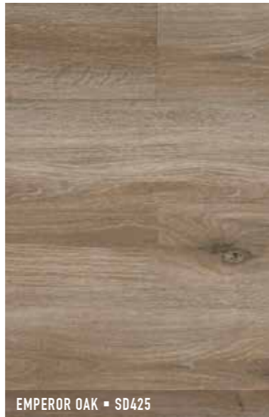
EMPEROR OAK ▪ SD425