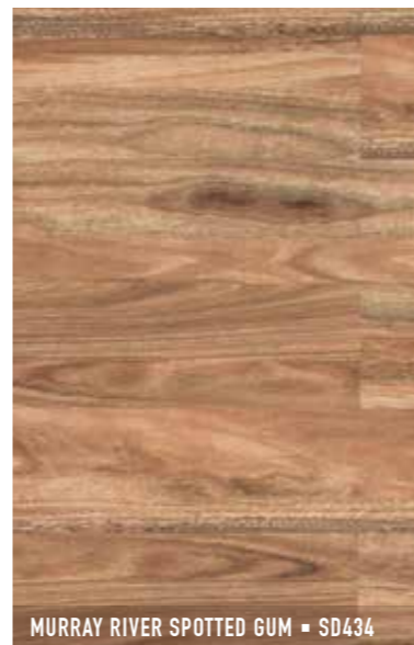
MURRAY RIVER SPOTTED GUM ▪ SD434