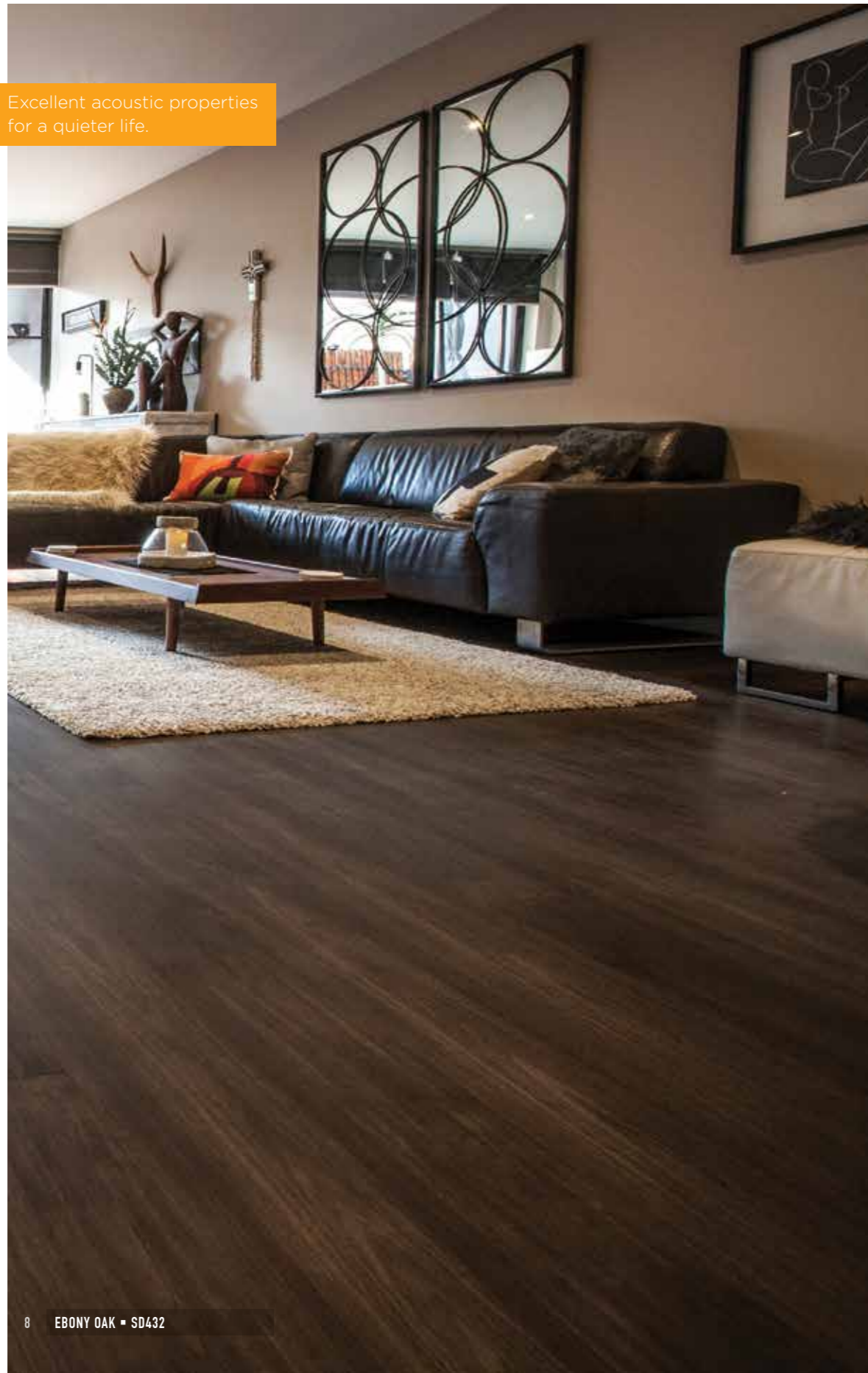
8 EBONY OAK • SD432

Excellent acoustic properties for a quieter life.