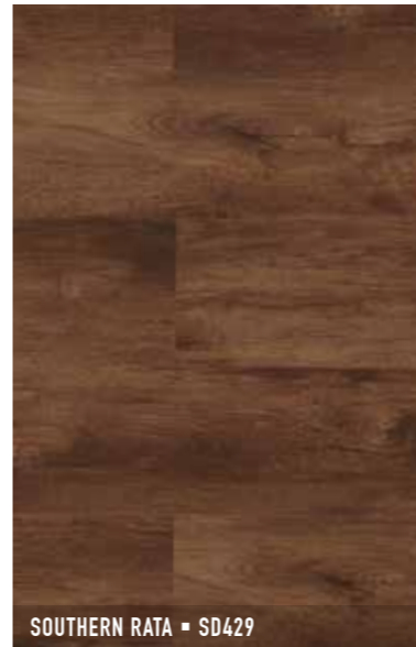
SOUTHERN RATA ▪ SD429