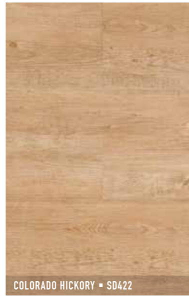
COLORADO HICKORY ▪ SD422