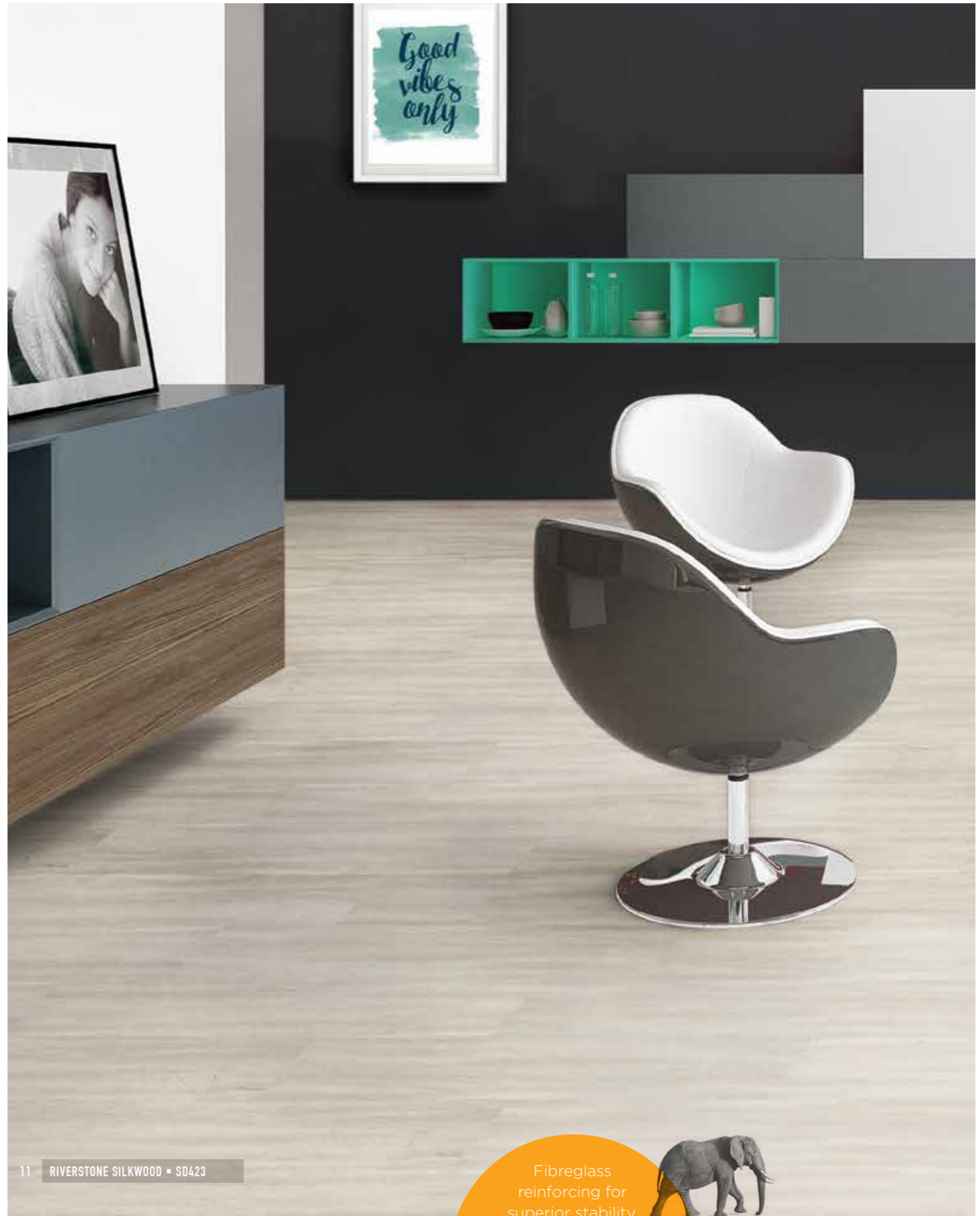
11 RIVERSTONE SILKWOOD • SD423

Fibreglass reinforcing for superior stability.