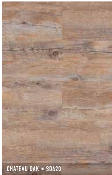
CHATEAU OAK ▪ SD420