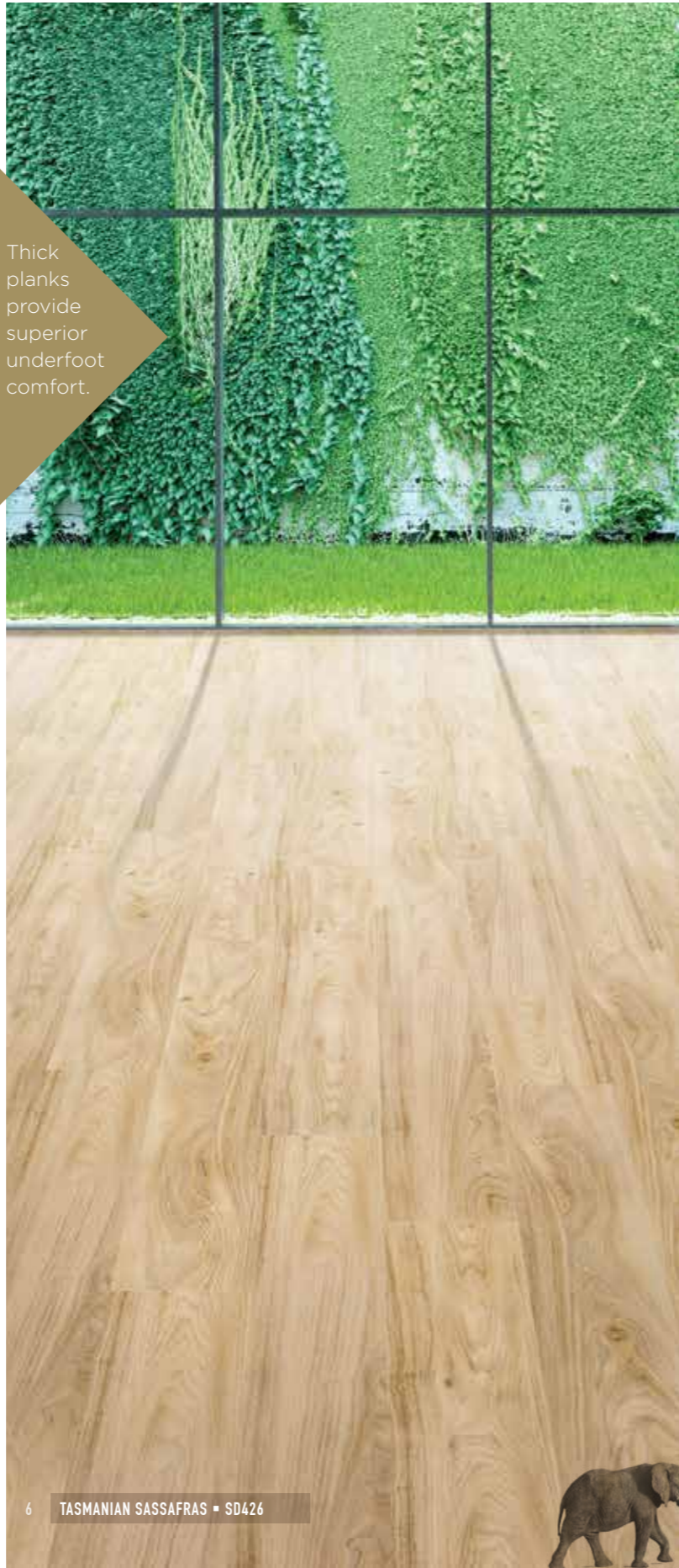
6 TASMANIAN SASSAFRAS • SD426

Thick planks provide superior underfoot comfort.