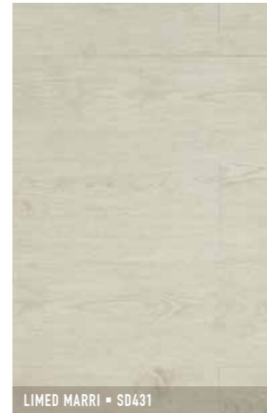
LIMED MARRI ▪ SD431