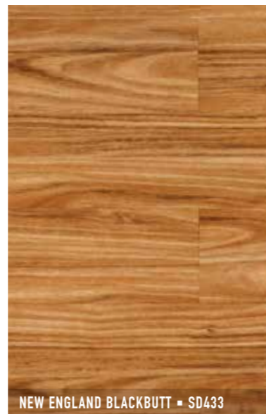
NEW ENGLAND BLACKBUTT ▪ SD433