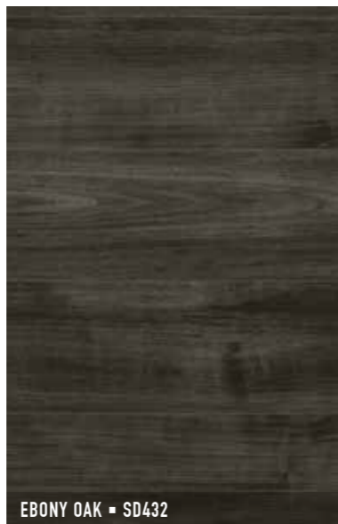
EBONY OAK ▪ SD432