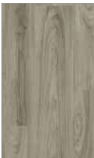
730 NOTTING HILL