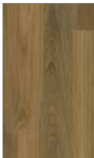
555 COLONIAL SPOTTED GUM