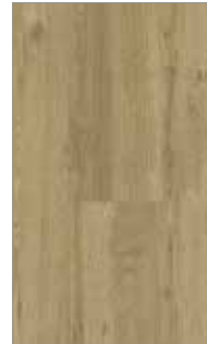
520 PARK LANE