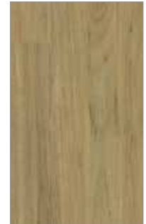
530 ST JAMES