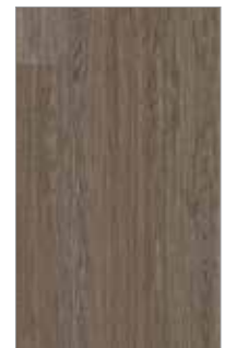
640 FLEET STREET