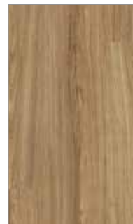
625 MARBLE ARCH