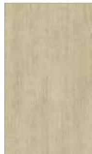
560 HIGH STREET