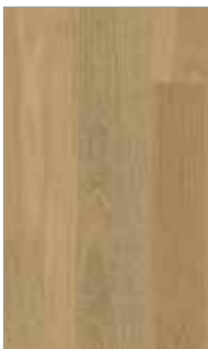
545 COLONIAL BLACKBUTT