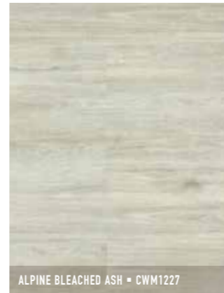
ALPINE BLEACHED ASH • CWM1227