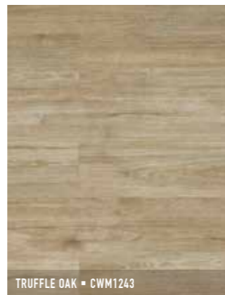
TRUFFLE OAK • CWM1243