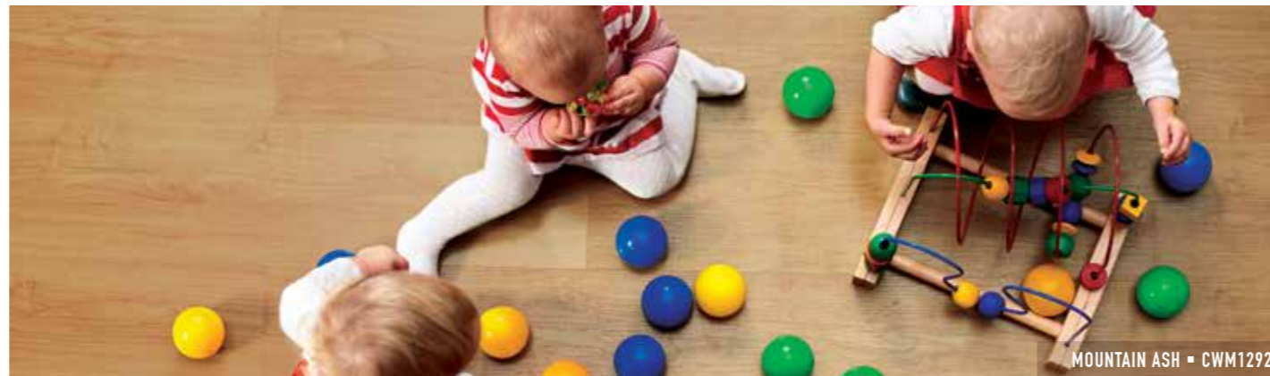
MOUNTAIN ASH • CWM1292