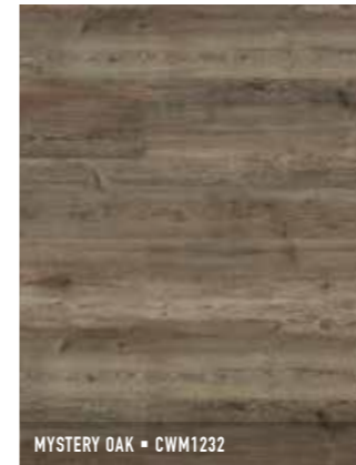
MYSTERY OAK • CWM1232