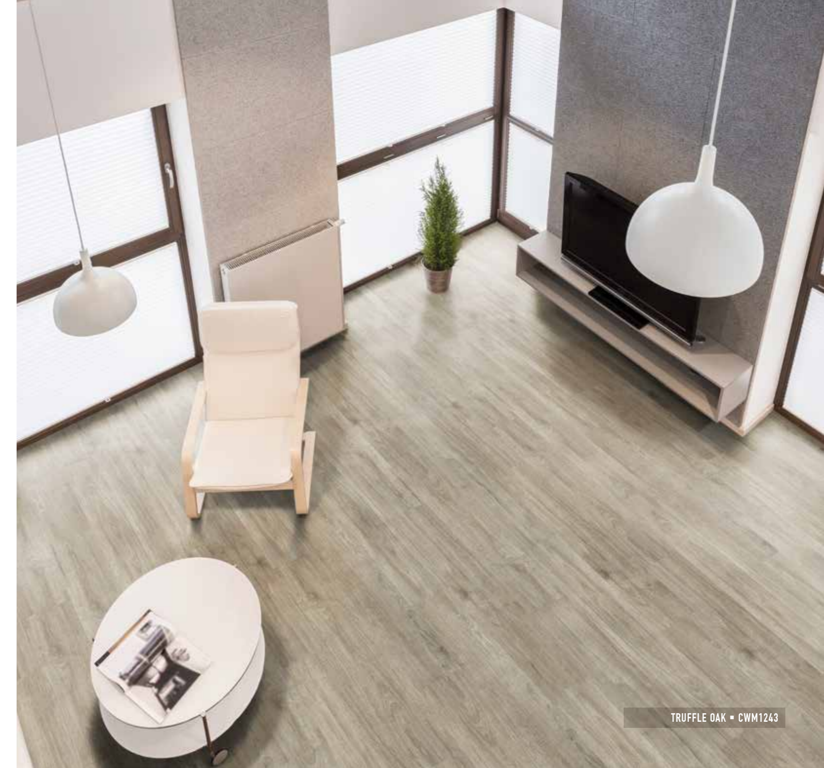
TRUFFLE OAK • CWM1243