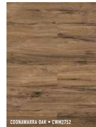
COONAWARRA OAK • CWM2752