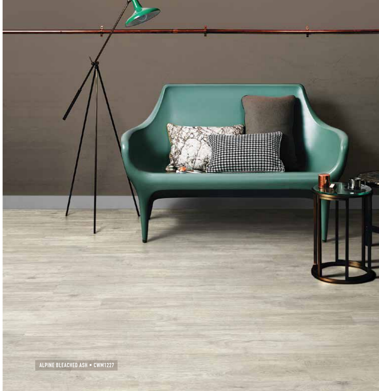
ALPINE BLEACHED ASH • CWM1227