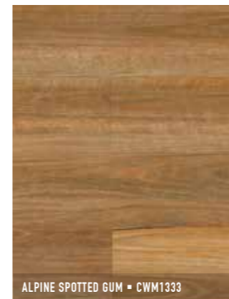
ALPINE SPOTTED GUM • CWM1333