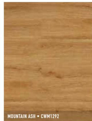
MOUNTAIN ASH • CWM1292