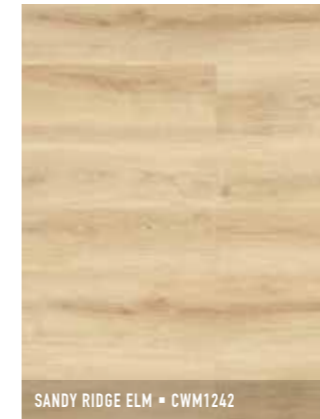
SANDY RIDGE ELM • CWM1242