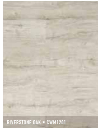
RIVERSTONE OAK • CWM1201