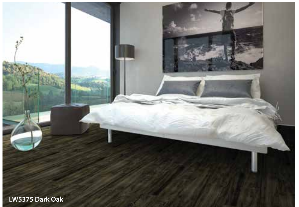
LW5375 Dark Oak