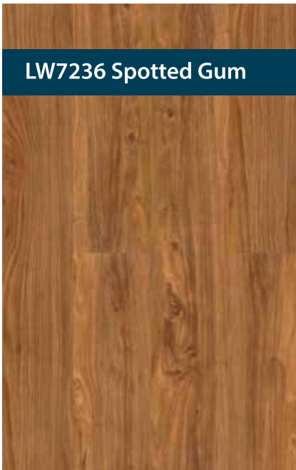
LW7236 Spotted Gum