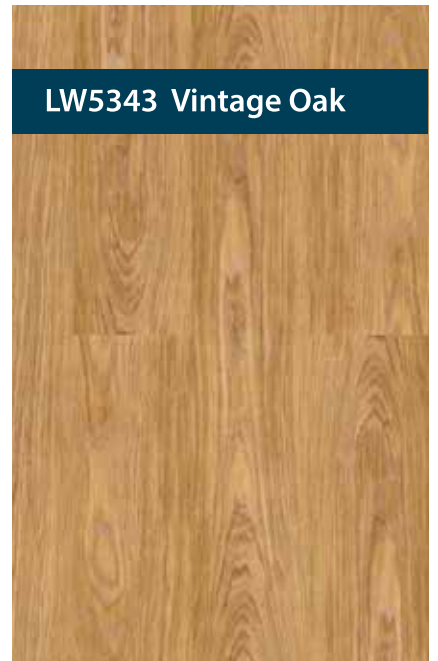
LW5343 Vintage Oak