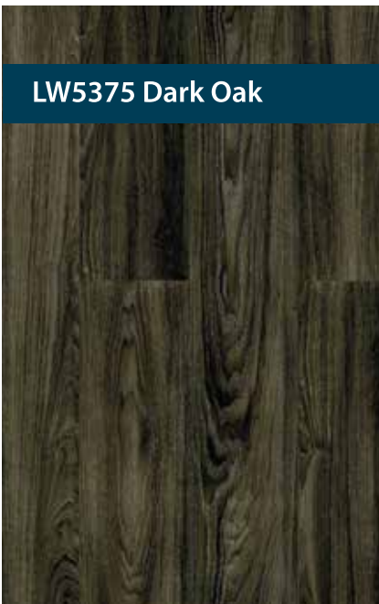
LW5375 Dark Oak