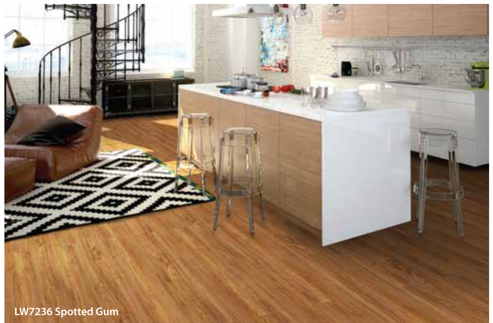
LW7236 Spotted Gum