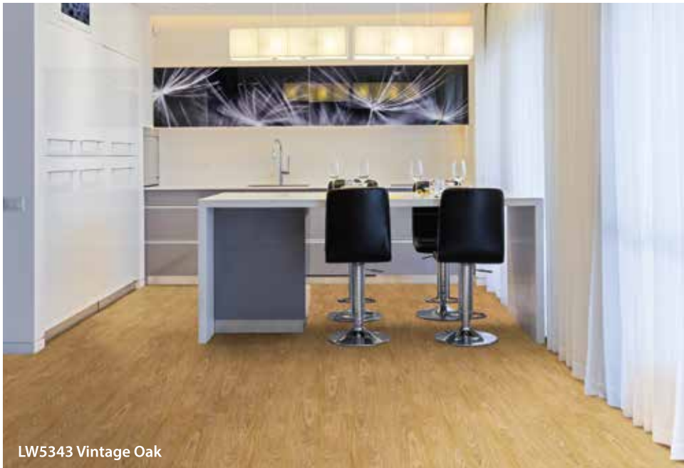
LW5343 Vintage Oak